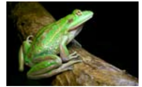
Growling Grass Frog