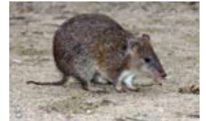
Southern Brown Bandicoot