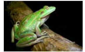
Growling Grass Frog